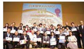
The Nihon-Ryugaku Awards