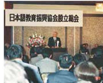
The inaugural meeting of the Association for the Promotion of Japanese Language Education