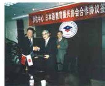
The signing of the Chinese certification system agreement