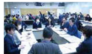
Daily life guidance counselor training