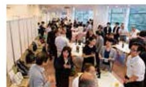
Exchange meeting at the Japanese Language School Education Research Convention