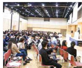
The Joint Orientation for Vietnamese Study Abroad Students