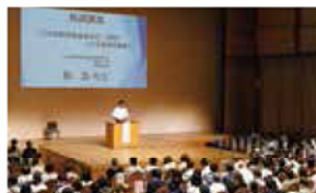
Keynote speech by Hiroshi Hase, Secretary General of the Diet Members Caucus for the Promotion of Japanese Language Education, at the 2018 Japanese Language School Teacher Research Convention

Administrative and supervisor staff training courses